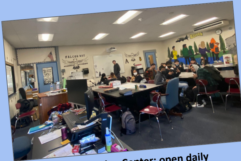
Tutoring Center: open daily

Support Programs for college and career, financial aid and scholarships (Room 401):